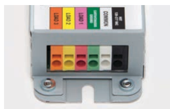
Color-coded push-pin connectors make installation easy

Low Voltage Controllers enable users to safely operate the high-voltage lighting found in hospital and nursing home rooms with their pillow speaker or bed communication side rail. They're tested and approved for use with all nurse call systems that use a switch with normally-open momentary dry contacts for auxiliaries.