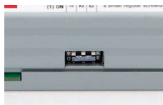
DIP switches allow the installer to select one of four operational modes.