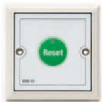
DRB-11 RESET BUTTON (Included in kit)