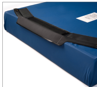
Attaches to stretcher deck with the included hook and loop fasteners and snaps