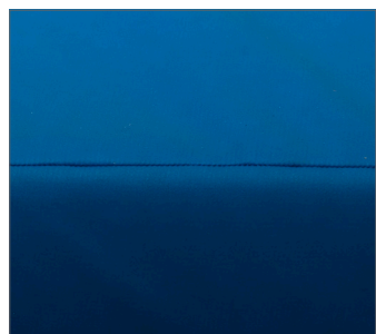
Fully sealed with waterproof welding to prevent fluid ingress