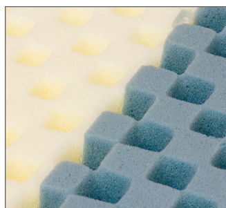
The topper is made of 100% high density polyurethane foam, and features different firmness levels for the body and feet.