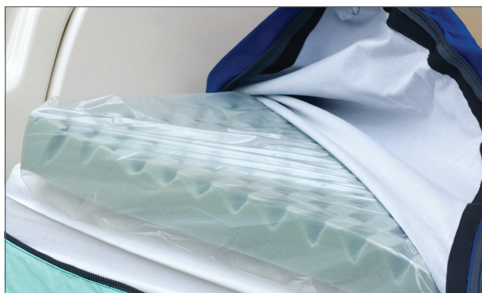
Surgical grade polyurethane film is used as a moisture vapor barrier sheet between the foam core and the top cover.